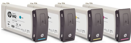
8 (2 x 775-ml per color with auto-switch)